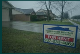
5 markets with the best (and worst) potential for landlords