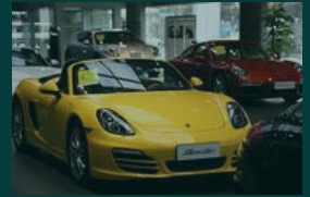
5 biggest price hikes for new cars