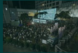
Scenes from the Hong Kong democracy march