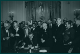
A look at progress on jobs and pay since Civil Rights Act